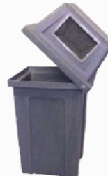
Lid hinges to the side!