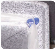
Shown with plastic bag clip.